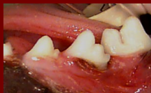
Stage 3 Gum recession