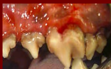
Stage 4 Severe periodontal disease