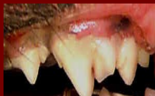
Stage 2 Moderate tartar