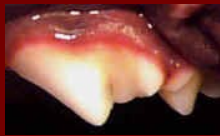
Stage 1 Red, inflamed gums