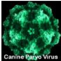
Canine Parvo Virus

Treatment focuses on controlling vomiting and diarrhea and administering